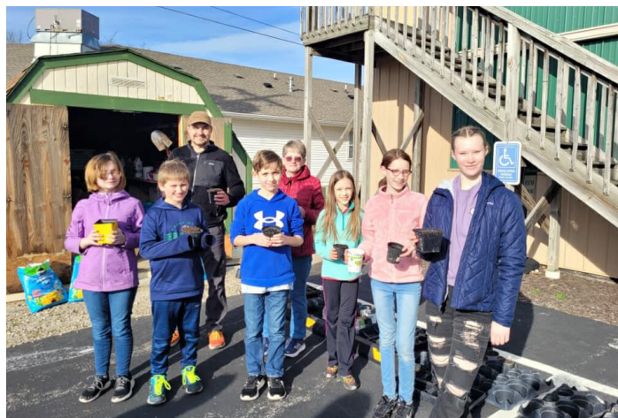
The WOW youth went out into the community to spread some compassion! Our K-2nd graders went to FISH food pantry and our 3rd-8th graders went to Christ Lutheran Church's community garden!