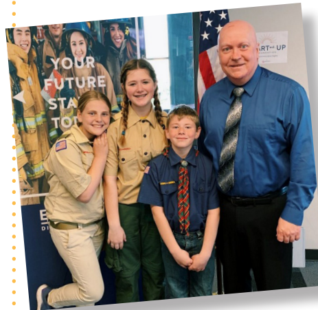
Troop 247 and Pack 909 represented at Governor's breakfast