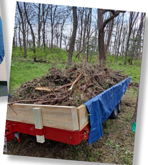
Trailer load of brush cleaned out from the old cemetery behind First Baptist Church for Eagle Project.