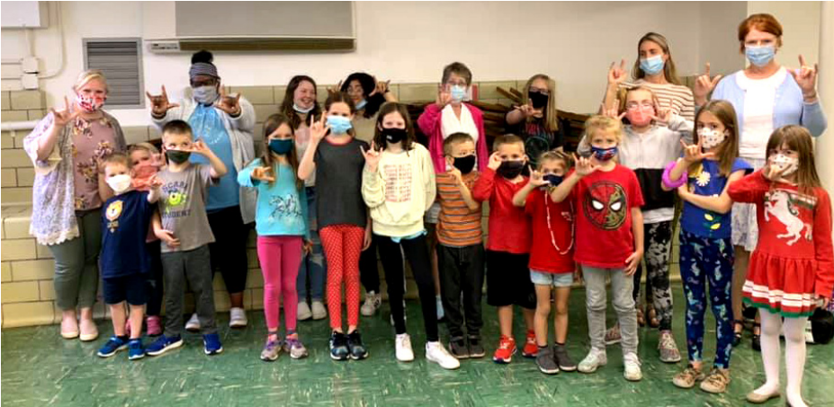
Youth saying "Love" in American Sign Language as they learn about God's love and spread it to everyone they see!