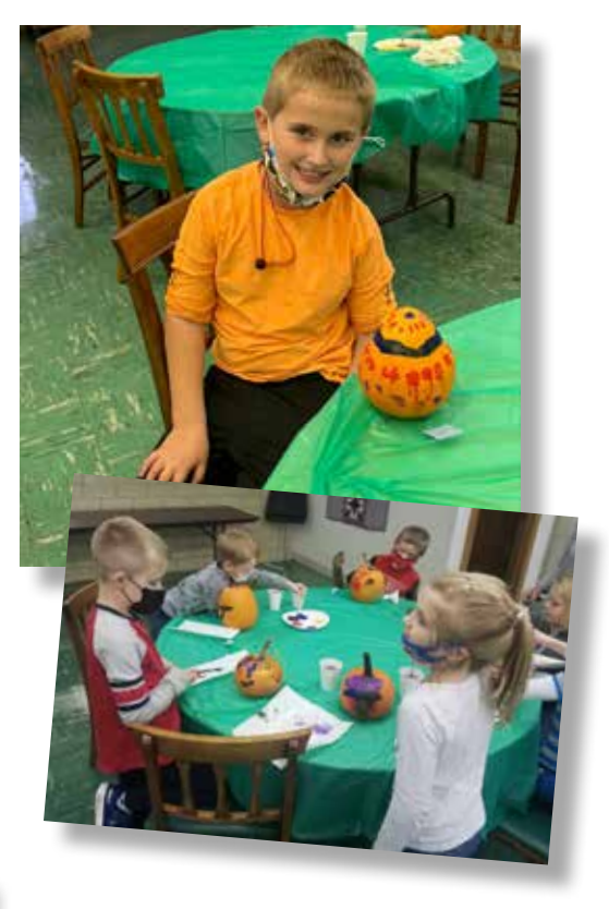
WOW Painting Pumpkins!