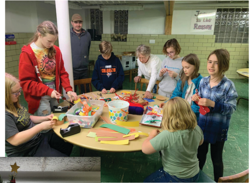
WOW youth making ornaments for the fellowship hall Christmas tree

WOW had a wonderful Christmas season! We will be on break until January 11th.